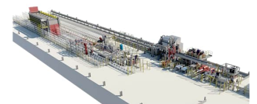
Extrusion full-line Layout

We sell World-Top-Share Mitsubishi Diamond Industrial Co., Ltd.'s liquid crystal basement glass cutting equipment as an agent. And also selling other equipment and materials to big manufactures in Flat Panel Display (FPD) industry domestically and internationally. Glass cutting equipment are used in the process of manufacturing LCD TVs, displays of such PC, Cell phone, car navigation and many other. We also develop vulnerable material cutting other highly accurate cutting and variant shape cutting needs other than FPD glasses.