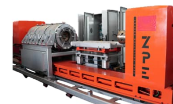
Z.P.E. Magnetic Heater