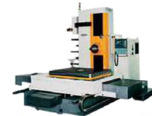
Horizontal boring/milling machine (NOMURA Machine Tool Works Ltd.)

For machine tools, we mainly sell Japanese multi spindle CNC lathe, Horizontal boring mill and Middle to Large class lathe to North American and European markets. Multi spindle CNC lathe has many installation histories for automotive industry's mass production use and Horizontal boring mill sale location in Chicago, IL. Providing installation service, commodity sales and maintenance service. In Europe, we have each different reliable partner at different countries and satisfying customer's needs.