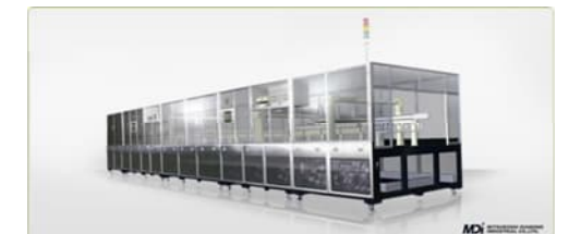
Liquid Crystal Cutting Line for the 8 th generation (2000mm×2000mm)

Glass grinding equipment Glass edge application equipment