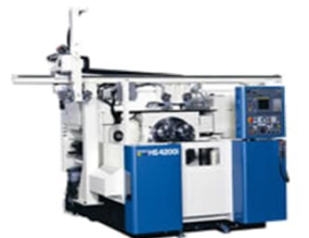
Multi spindle CNC lathe (Shimada Machine Tool Drivers Co., Ltd.)