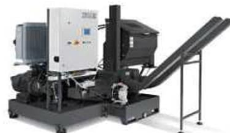
RUF(Germany) Briquetting machine