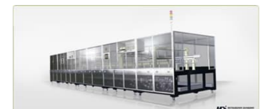
Liquid Crystal Cutting Line for the 8th generation (2000mm×2000mm)