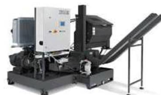
RUF(Germany) Briquetting machine