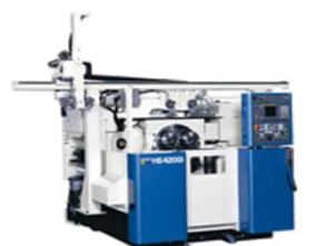
Multi spindle CNC lathe (Shimada Machine Tool Drivers Co., Ltd. )